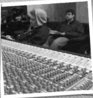
Audio & Recording Arts