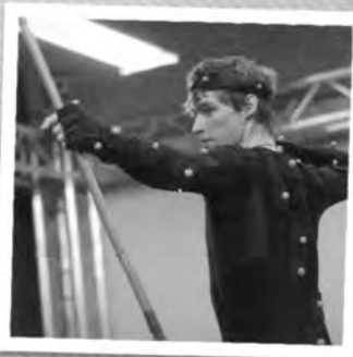
Animation & Game Design