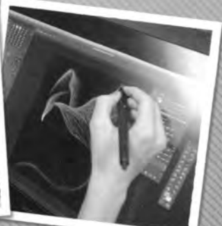
Graphic & Web Design

Are you a Junior or Senior looking to earn college credit at no cost? Contact admissions to see if you qualify for our Kickstart Program!